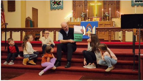
Children's Good News Time